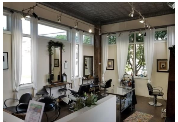
Esso gas station, elegantly transformed

There are seven stylists at Oliver's Twist. Some work fulltime, and others, part time. To better help me write this article, I decided to give Oliver's Twist a try. Although I moved to Roanoke in 2019 from Richmond, Virginia, I was still using my long-time and much-loved stylist back home. I just couldn't give her up! I could not have been more pleased with the ambiance of Oliver's Twist physical space, and especially with the professionalism of the stylists. The stylists are wonderfully trained and are magicians in giving you the look you want! Oh, and one of the best treats—as clients are waiting for their hair to process, they can enjoy the beautiful