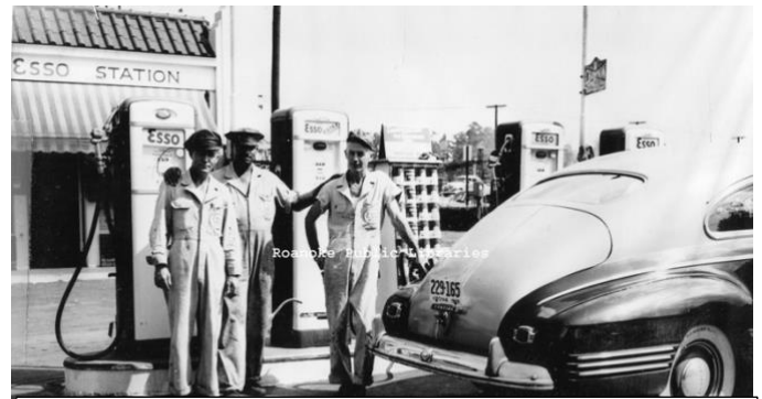
1940s Roanoke Esso Station

There are seven stylists at Oliver's Twist. Some work fulltime, and others, part time. To better help me write this article, I decided to give Oliver's Twist a try. Although I moved to Roanoke in 2019 from Richmond, Virginia, I was still using my long-time and much-loved stylist back home. I just couldn't give her up! I could not have been more pleased with the ambiance of Oliver's Twist physical space, and especially with the professionalism of the stylists. The stylists are wonderfully trained and are magicians in giving you the look you want! Oh, and one of the best treats—as clients are waiting for their hair to process, they can enjoy the beautiful