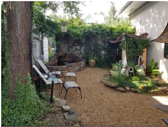
Courtyard with tranquil koi pond

(transformed, really), and Oliver's Twist was born in the Historic District of Old Southwest. The salon is a cooperative of independent hair stylists who each separately maintain their own individual business practices and policies.